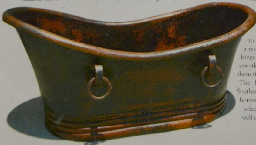
22 MONTGOMERY LIVING

With a huge variety of original and one-of-a-kind architectural pieces, the store is basically a warehouse packed to the brim with hundreds of antique entryways, beveled and stained glass doors, antique stairways, original antique lighting, fire-place mantels and more. The extensive selection dwarfs in number and sheer size the inventory of other antique stores.